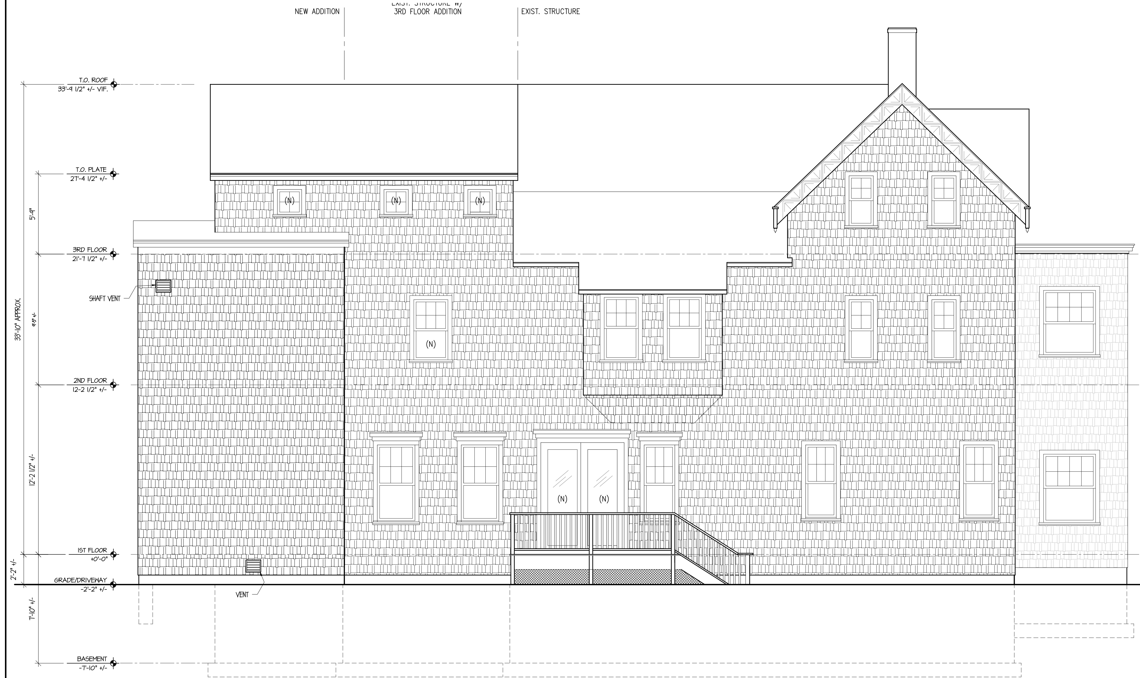
1 SOUTH ELEVATION 1/4" = 1'-0"